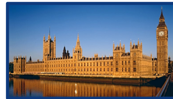
Houses of Parliament