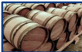
Barrels of Gunpowder