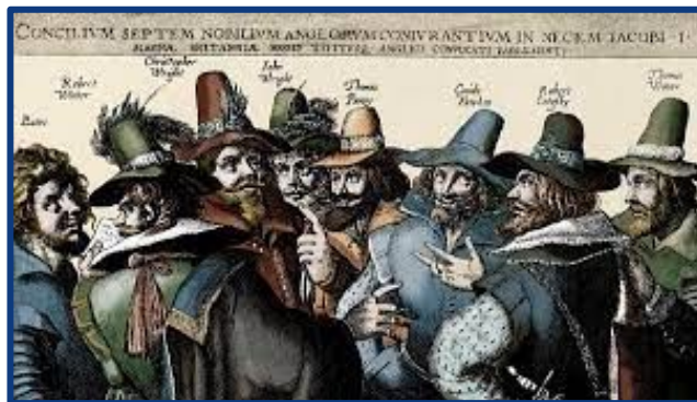
Guy Fawkes and his plotters