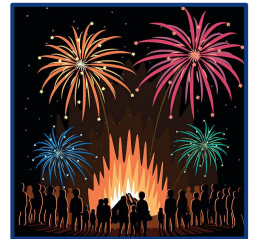
Guy Fawkes night