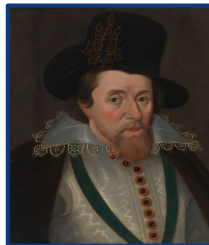
King James I